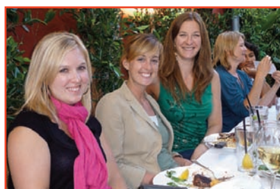
Los Angeles therapists enjoying our end of the year party in Santa Monica.